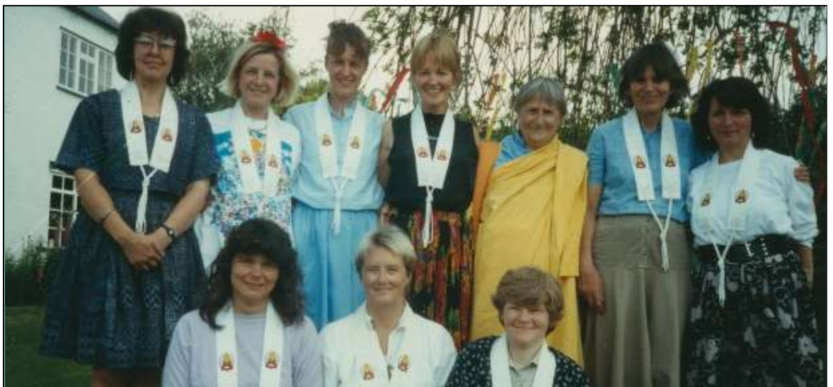
Taraloka community in its early days