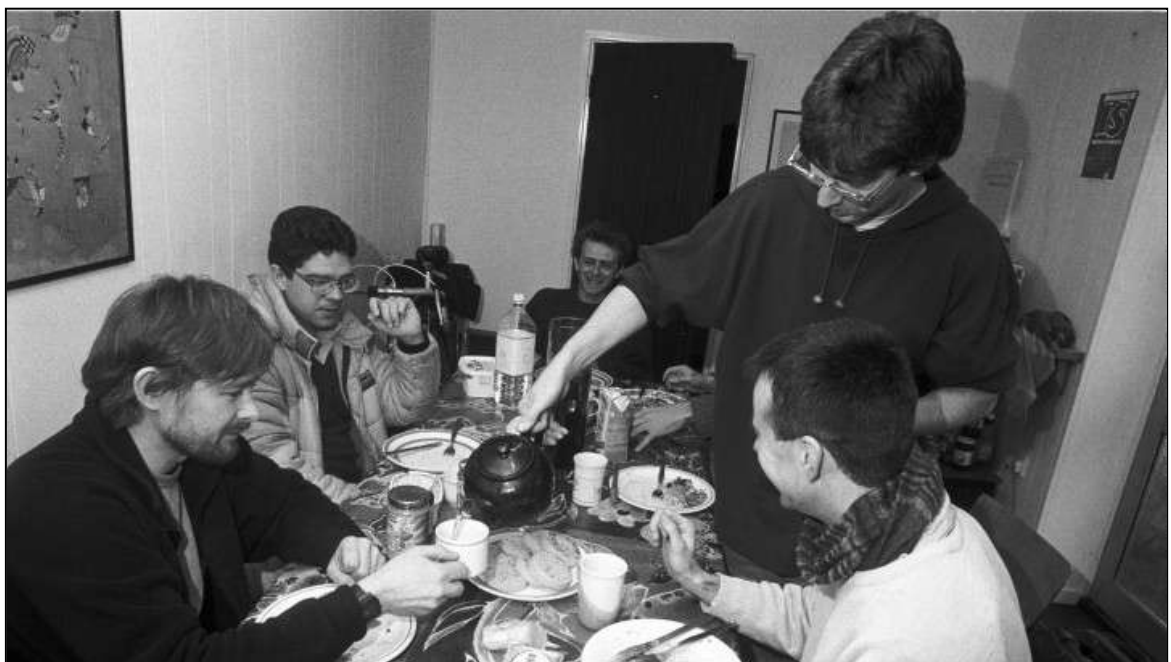
Windhorse:Evolution community, early 1990s