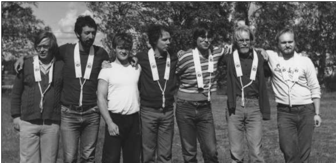
Padmaloka community in its early days