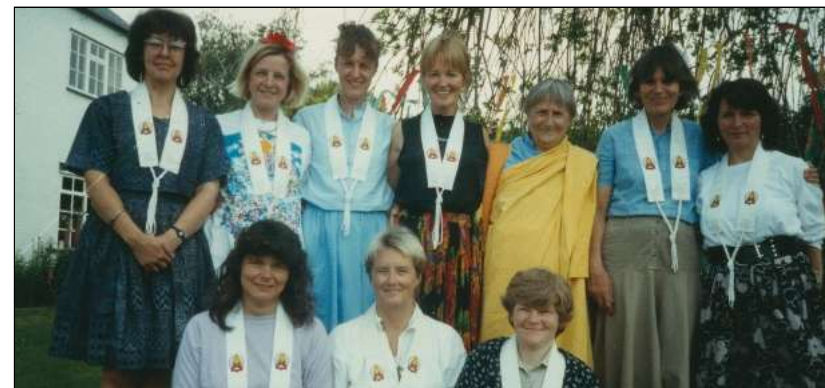
Taraloka community in its early days