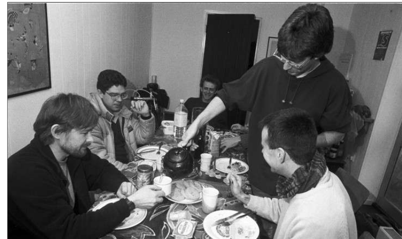
Windhorse: Evolution community, early 1990s