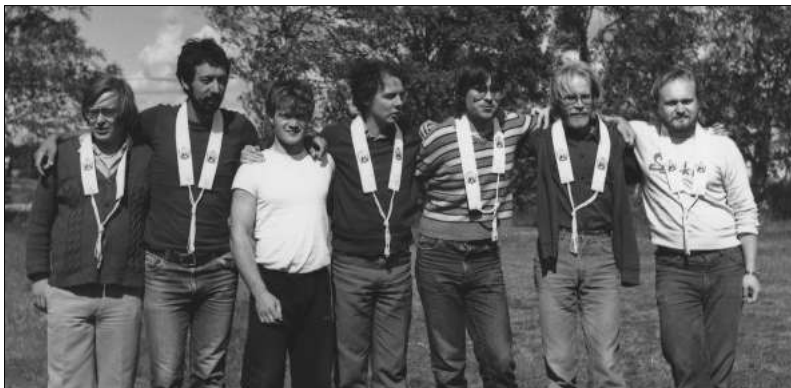
Padmaloka community in its early days